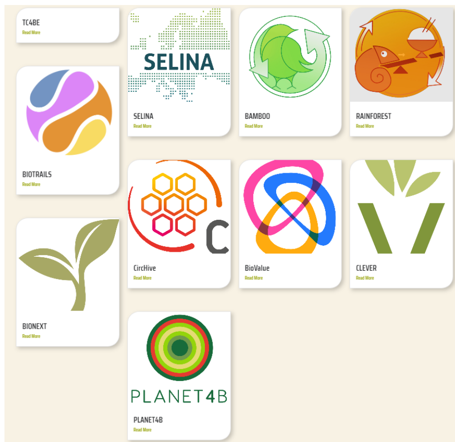
Figure 1: Sister projects as listed on BIOTraCes https://www.biotraces.eu/project/#sister

This report summarizes work already done and forthcoming plans by BIOTraCes on fostering collaboration and creation of synergies and cooperation with sister projects and initiatives of interest, including Horizon Europe activities such as the European Partnerships and Missions.